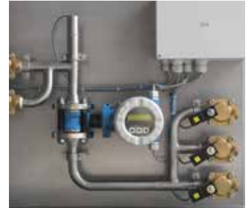
Water Dosing Systems