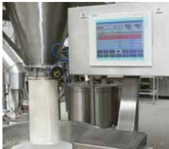
Controls & Automation