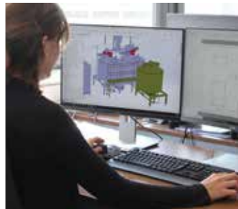
Process & Engineering