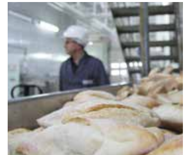
Customized planning and development