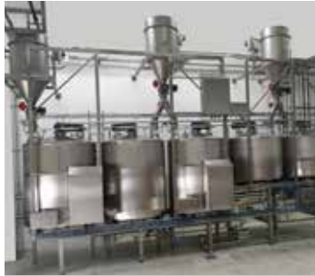
Pre-dough / Sourdough